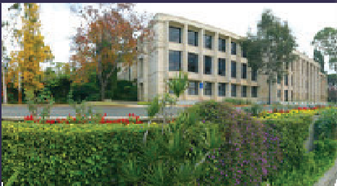
South-east corner of Parliament House