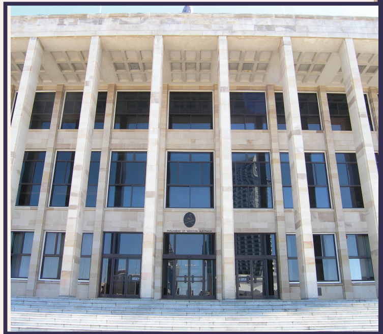
Front entrance of Parliament House